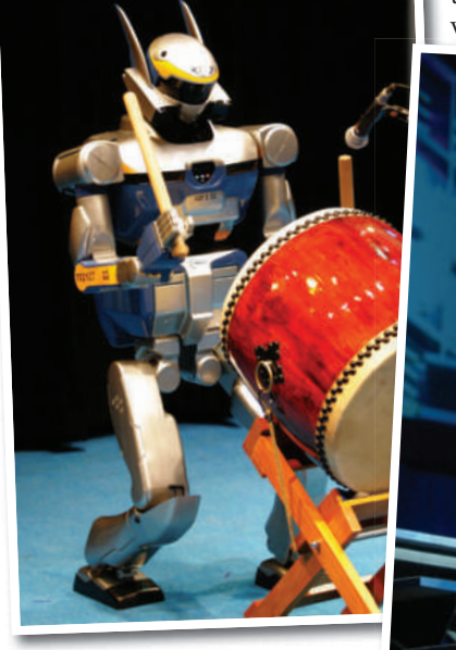
The Japanese robots HRP-2 (left) and ASIMO are able to do a range of tasks, from making music to walking on uneven surfaces.

ior researcher at the Bruno Kessler Foundation in a Trento, Italy, and a leading sepert in the application of artificial intelligence to linguistics, says that the 'bottom up' approach that iCub adopts can go only so far when it comes to language. "People in the field are coming to terms with the fact that to explain language, you have to presume some innate abilities for it, for grammar, and syntax in particular," he says. "I doubt that such a system can do more than utter single words without some kind of a priori linguistic skills, call it a language instinct if you want. That's what probably happens in humans too."