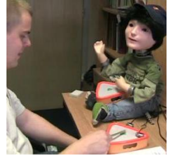
Figure 2 A screen shot from the experiments showing a person playing a drumming game with Kaspar.

drumming) if we played short sequences, but since the model is not bounded by thresholds, it 'reacts' to the human but does not exactly 'imitate' the games, which might not be accepted by participants.