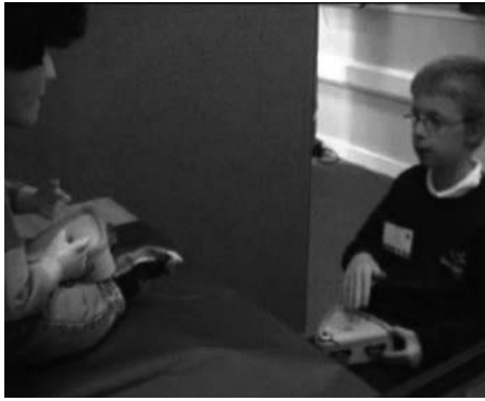
(a) Physically embodied robot, Kaspar and child participant