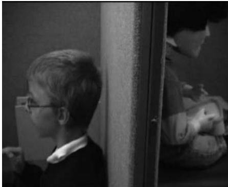
(c) Child participant playing the game with the 'disembodied' robot in the sound only condition , where the robot is hidden but audible and only its drumming sound is heard.

Fig. 2 Screenshots from the experiment with children where they played (a) with the physical robot, (b) watching a projected image of the robot, and (c) hearing only the sound of the robot