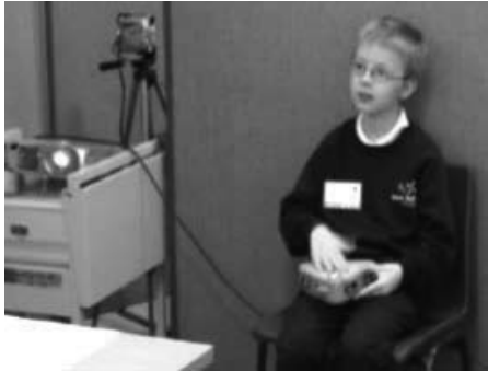
(b) Child participant is playing the game in the projection condition where the robot's live performance is captured by a camera and projected to a wall in front of the child.