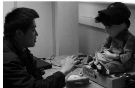
Fig. 1 A screen shot from the experiments

The third experiment (with children) was carried out in two almost identical cubicles isolated from the rest of a room with high barriers (Figure 2). In the rest of the room other robotic activities took place at the same time with other children. In one cubicle we had Kaspar seated on a table with the drum on its lap, similar to the first two experiments. In the second cubicle instead of the table and the robot Kaspar, we projected a real time image of Kaspar on a whiteboard, in order to study the effect of the robot’s embodiment (physically present versus remotely located). For the third condition, where only the sound of the robot was heard (disembodied robot), we use the same setup but turned off the projector. (See Figure 3). All other aspects of the experimental setup were kept the same.